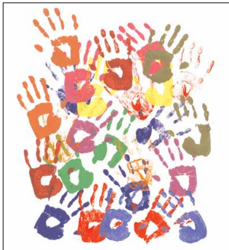
Diversity in the workplace is a positive progression, especially in the tourism industry. We are serving a diverse clientele. Having a diverse workforce helps us to develop the interpersonal skills necessary to do so.

A diverse workforce with various skills can accomplish that more easily than one that is similar. Organizations that have a diverse workforce are more capable of providing a vari-